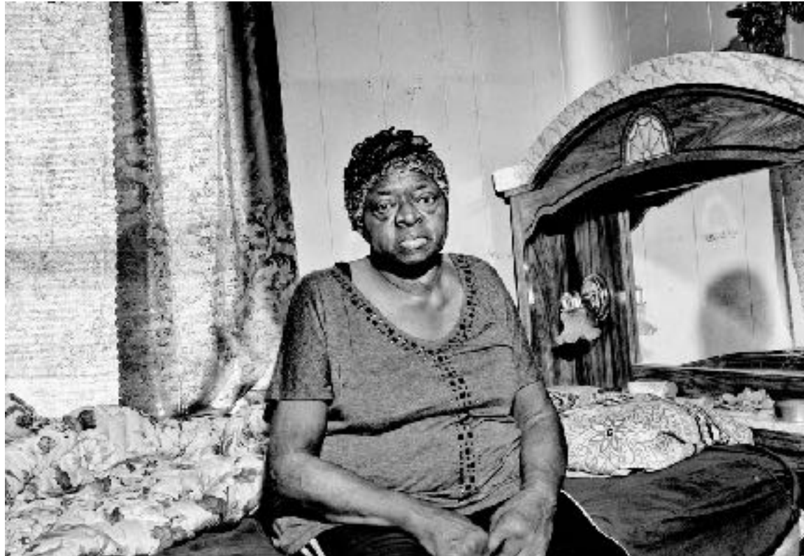
The Hopelessness of Loneliness